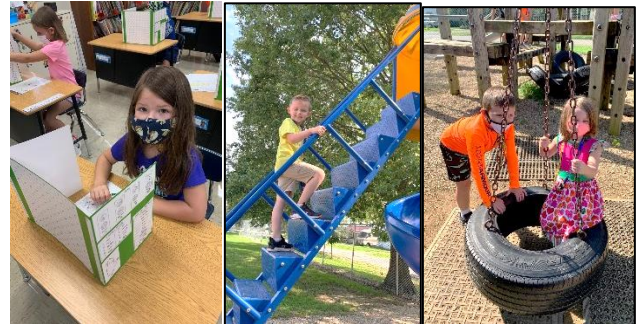
1 st grade at work and recess.

Parents who need to come to the building during either pick-up time are asked to park on the north or south side of the building avoiding Edwards St.