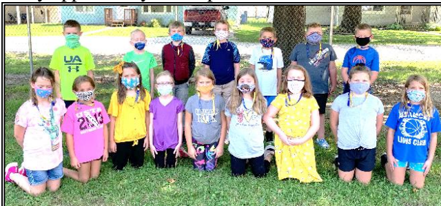
3 rd grade on their first day of school.

THANK YOU to everyone who's donated COVID-19 supplies to help keep everyone safe at school. We really appreciate your help.